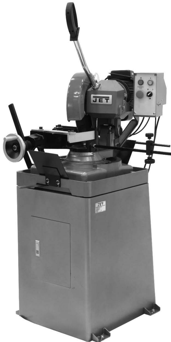
model CS-275-1 shown

JET 427 New Sanford Road LaVergne, Tennessee 37086 Ph.: 800-274-6848 www.jettools.com